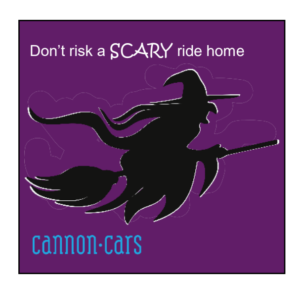
Purple Flag's Halloween theme beer mat

Purple Flag also organised a meeting between licensees of clubs and bars around Beckenham Junction and local residents, in late September, to discuss ways to cooperate on reducing noise and antisocial behaviour outside their premises. This was the second such meeting which both licensees and residents have found helpful and beneficial. The Purple Flag team thanks these licensees for their active engagement with residents leading to positive and practical actions.