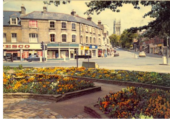
Thornton's Corner in 1978

Copers Cope Area Residents’ Association successfully applied to have the toilets listed as an Asset of Community Value, which means that the council have to offer it to a local group or other provider before selling it on the open market.