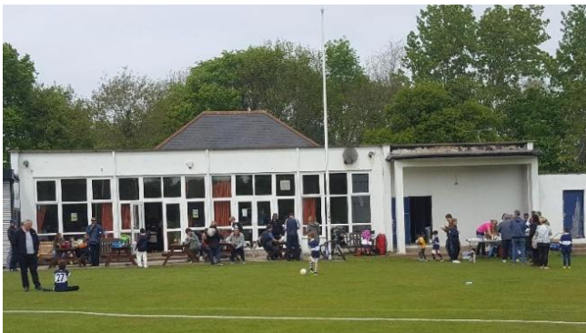
The Club House overlooking the pitch

The OD Cricket Club was formed in 2001 from the merging of the Old Dunstonians (OD) and Commercial Union (CUACO) cricket clubs when the latter's ground in Copers Cope Road was sold by Aviva to Crystal Palace FC. Nowadays it's open to anyone – not just former pupils of St Dunstons or Commercial Union employees!