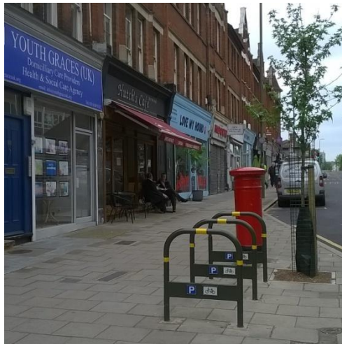
Clock House Parade