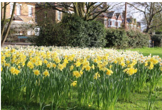
Daffodils in Cator Park