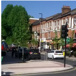
New paving at Thornton's Corner

Work is progressing well along the High Street and is on schedule. It has been a difficult time for those of us that use the High Street regularly, but WBRA thinks it will be well worth the disruption in the end. At the time of writing, work is edging towards Burnhill Road, which will be closed off for a few weeks. The council has made good efforts to liaise with residents and businesses around Kelsey Square and will manage the process carefully. Fairfield Road will continue to be one way as now, but from there, Burnhill Road one way direction to Kelsey Park Road will be reversed for the duration of the closure with the High Street.