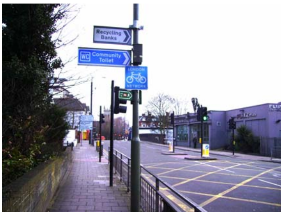
This picture shows the way to the Waitrose facility.

Also retail premises come and go, and have complete discretion to leave the scheme or gradually charge more, whereas public toilets are long-standing, well known and the Council controls the cost and availability.